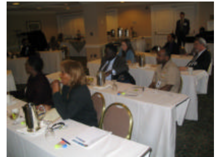
The attentive audience